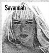
The porn star died in July of a self-inflicted gunshot wound.